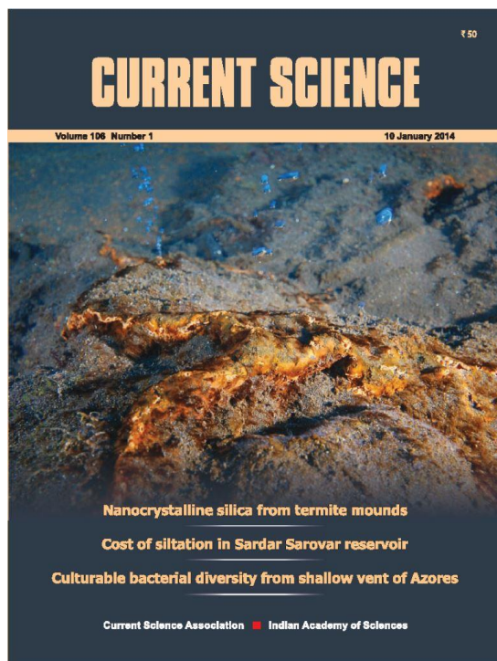
Current Science 2017, 113, 228-235