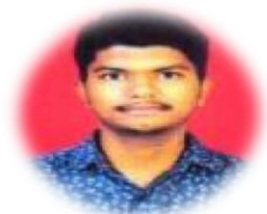
Saurabh Pawar Aakash Institute